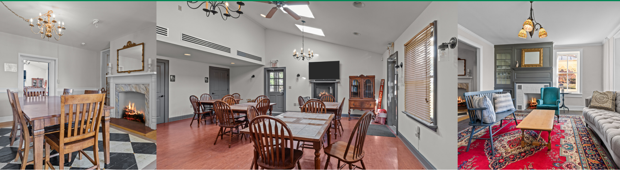
Ownership has made improvements to the overall property, while maintaining its original character.