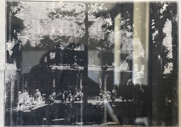
EXACT PICTURE OF ORIGINAL HOME.

Suitable for two families, one tenant house, one spring house and two barns. These buildings are all in first class condition. This is a wonderful opportunity for a home or investment. It is an ideal site for a Lumber and Coal Yard or Warehouse.