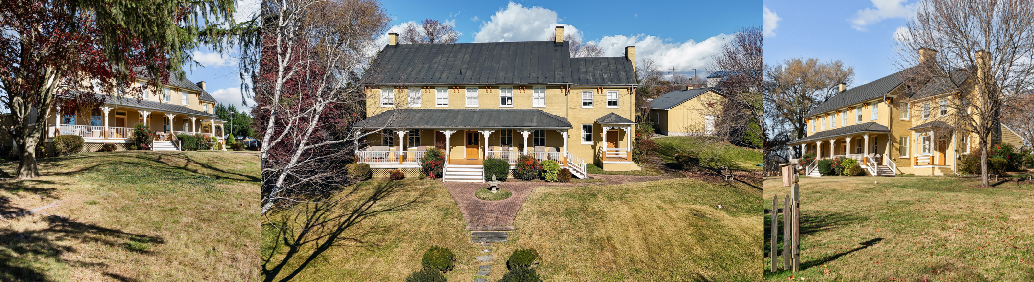
120 Water Street ("Atlee House"), constructed c. 1800, exudes remarkable charm from days gone by.